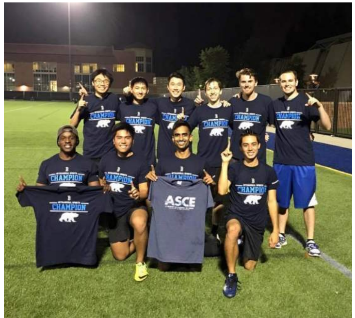
ASCE ULTIMATE FRISBEE TEAM The ultimate frisbee team members pose for a picture after a dominating performance for the championship