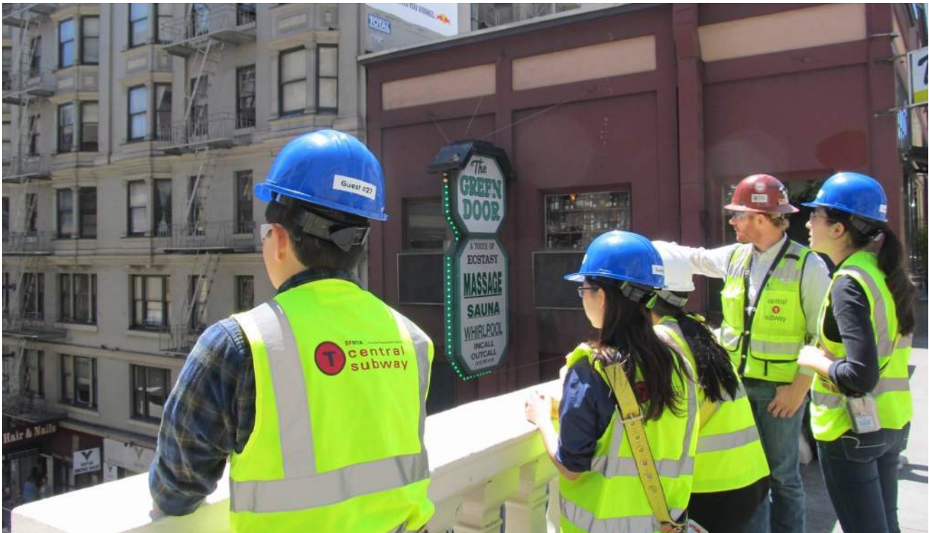
SAN FRANCISCO TUNNELING FIELD TRIP ASCE at UCLA members learning about the subway system in San Francisco