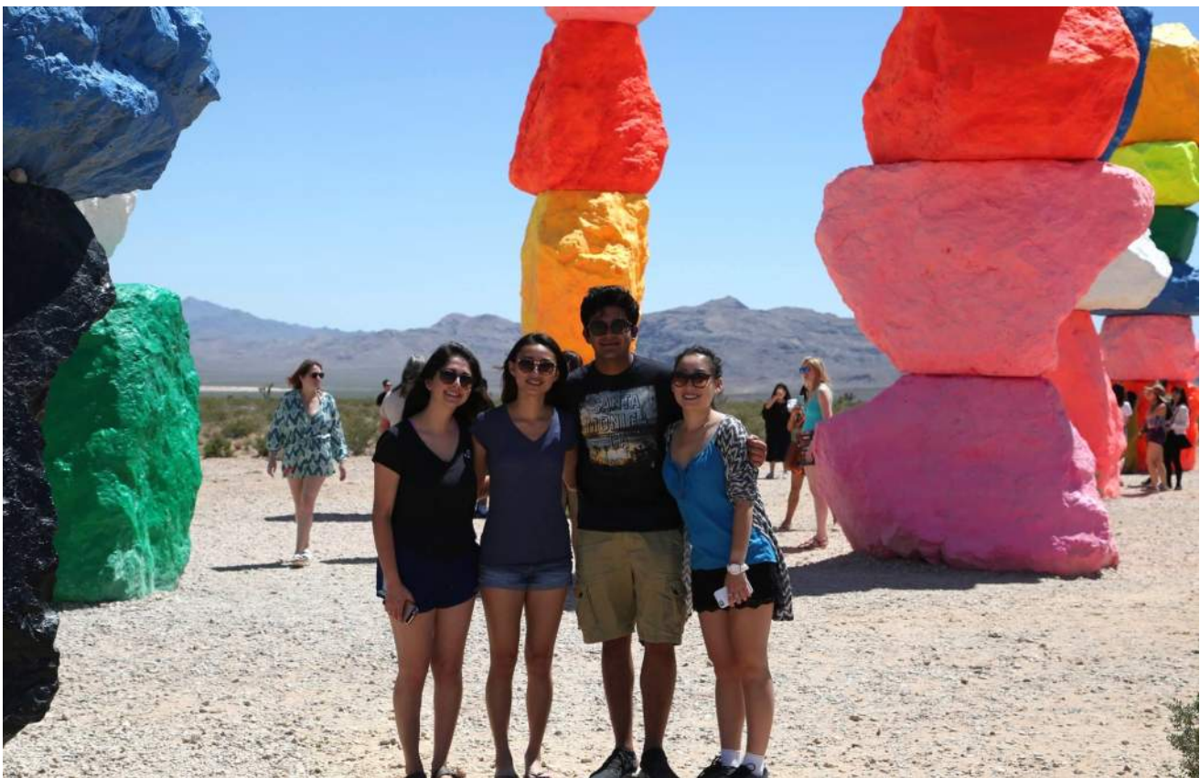
HOOVER DAM FIELD TRIP Members posing for a picture at a colorful landmark before reaching the Hoover Dam