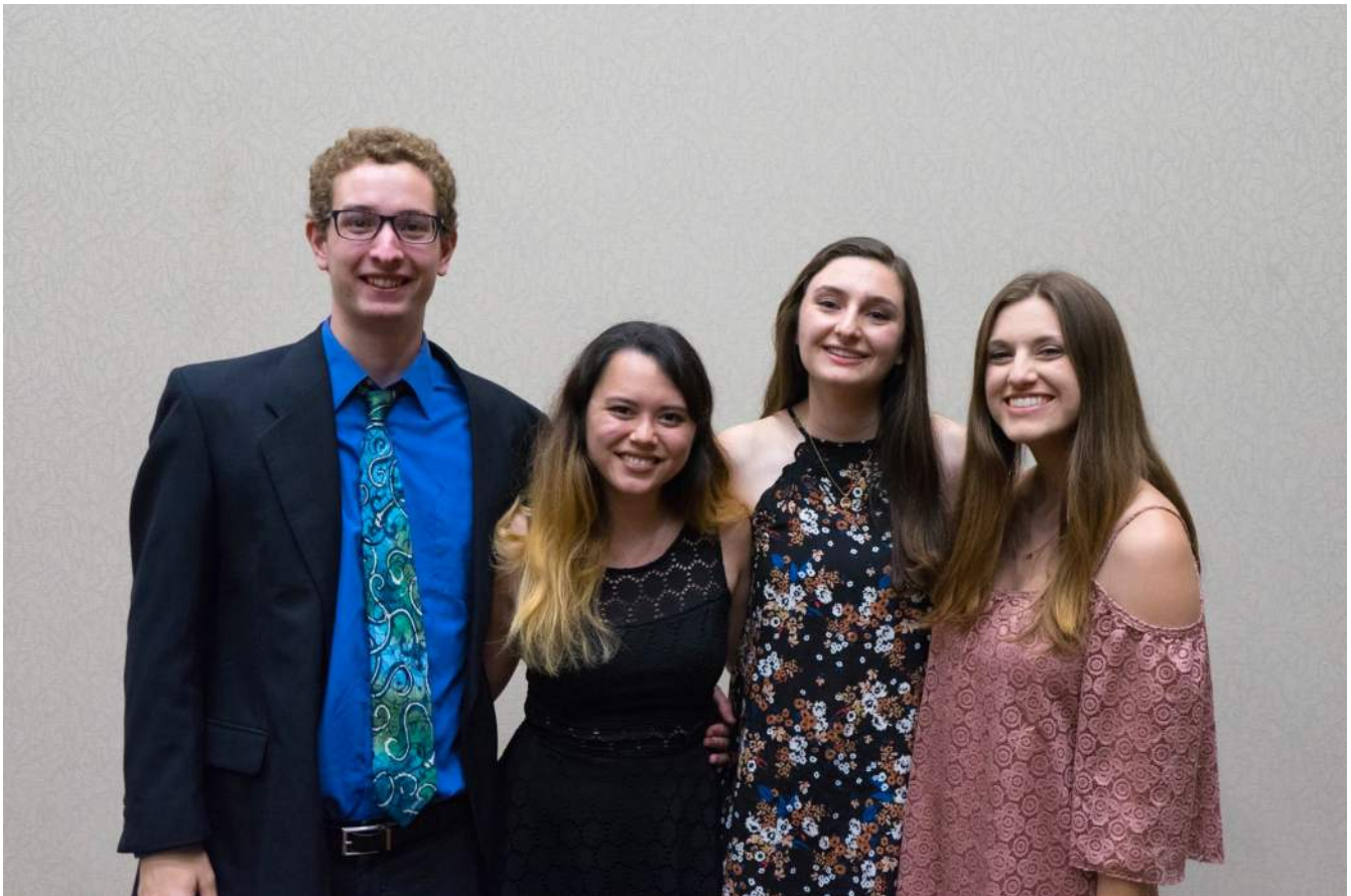
END OF THE YEAR BANQUET Our new CORE officers posing for one of their first pictures together at the annual banquet