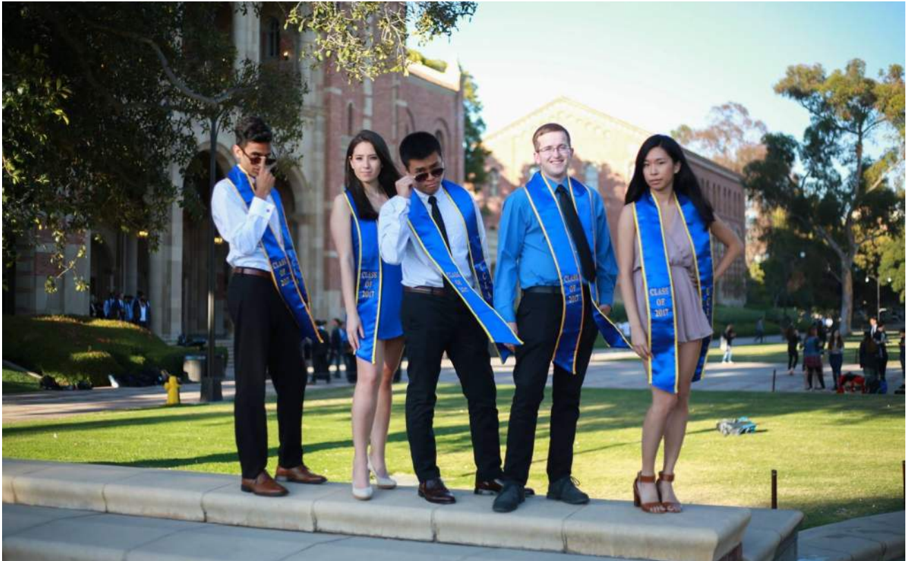
ASCE 2017 GRADUATING CLASS Members from the 2017 graduating class posing for a fabulous picture