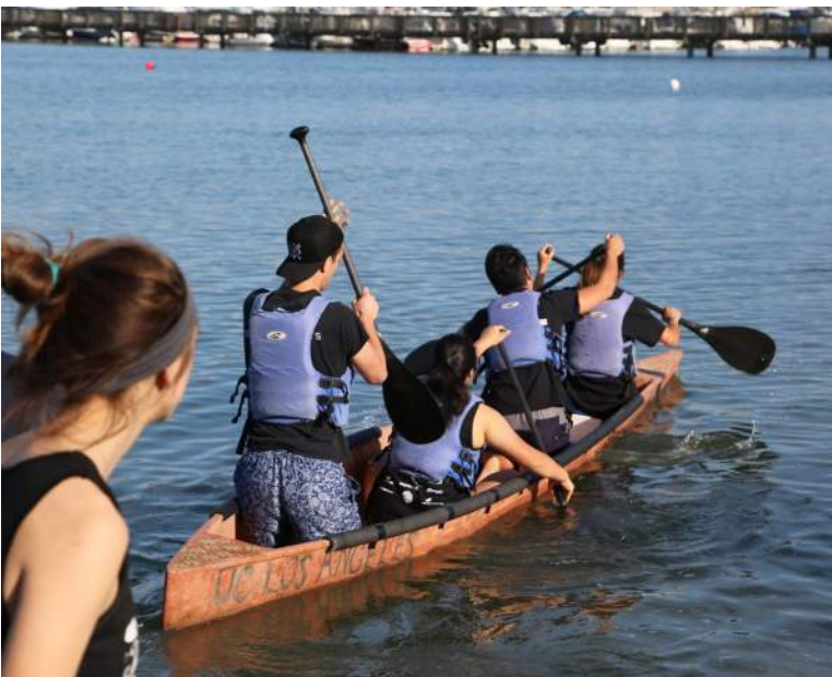
RACE DAY AT PSWC Members rowing to the start of the canoe race