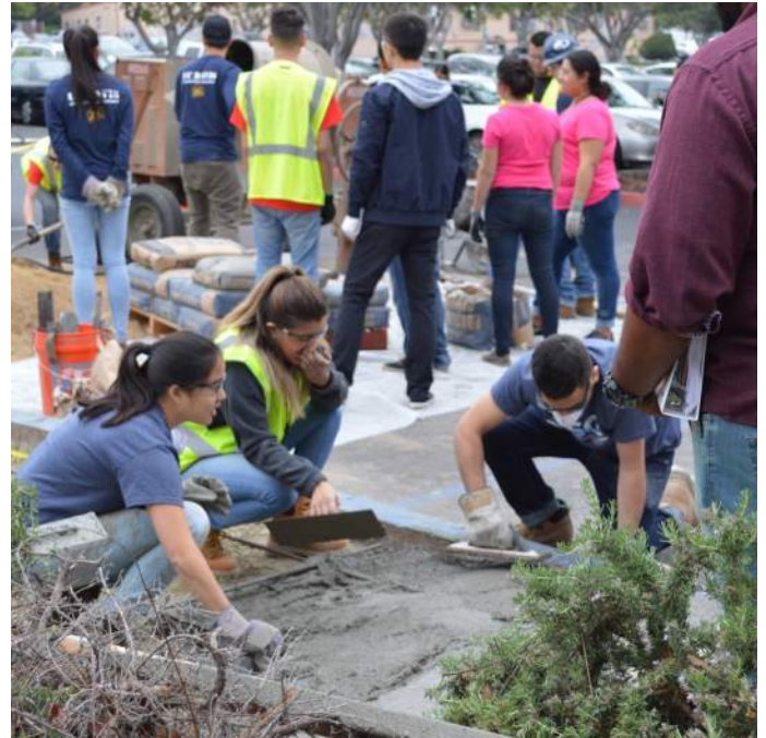
CONSTRUCTION COMPETITION Members paving the concrete sidewalk during the competition

Overall, our school team placed seventh out of 15 teams. Given that none of us had prior experience in building a sidewalk, the competition was a fun learning experience for all of us. Now that we have many experienced students in construction management, we look forward to being stronger contenders for next year's competitions.