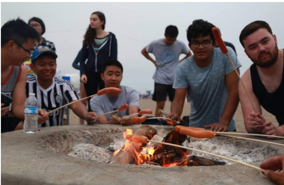
END OF THE YEAR BONFIRE Members roasting hot dogs at the annual event