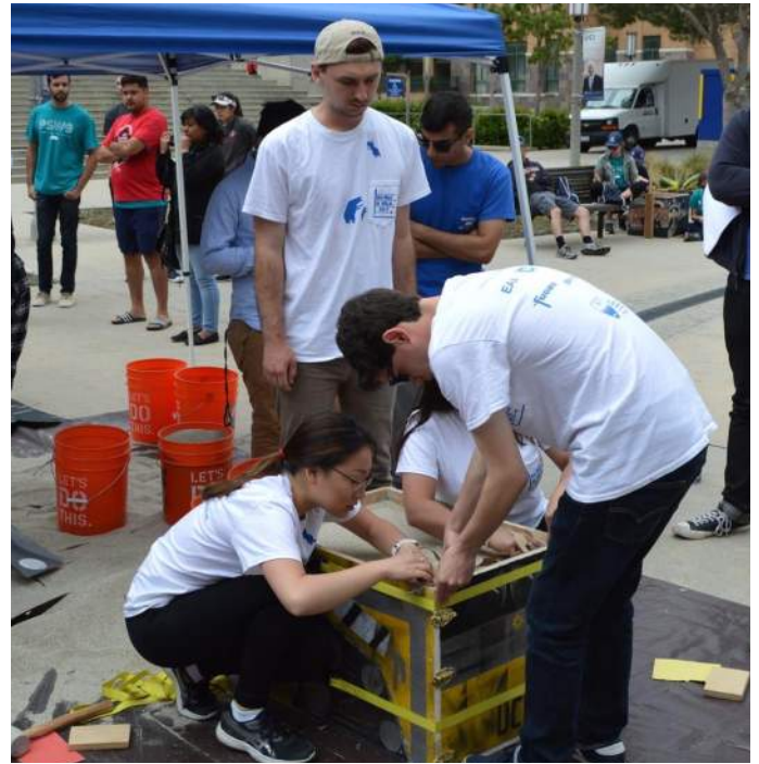
GEOWALL COMPETITION Members quickly building the retaining wall for the sandbox

Over the summer, the team began preparations for next year while waiting for the competition rules to be released. Each year brings new rules and new challenges and this team will be ready to take them on.