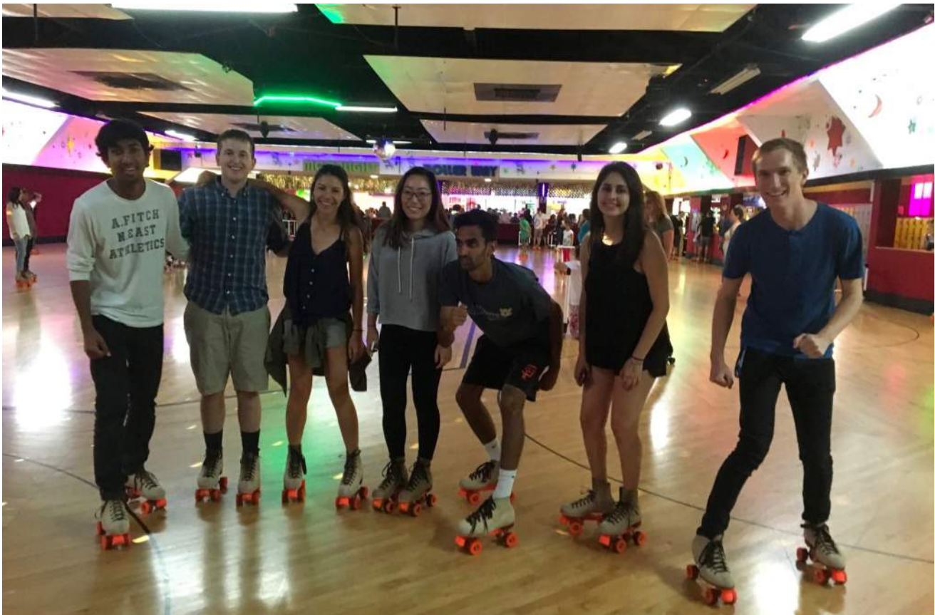
MOONLIGHT ROLLERSKATING SOCIAL Several members posing during the social at Moonlight Rollerway